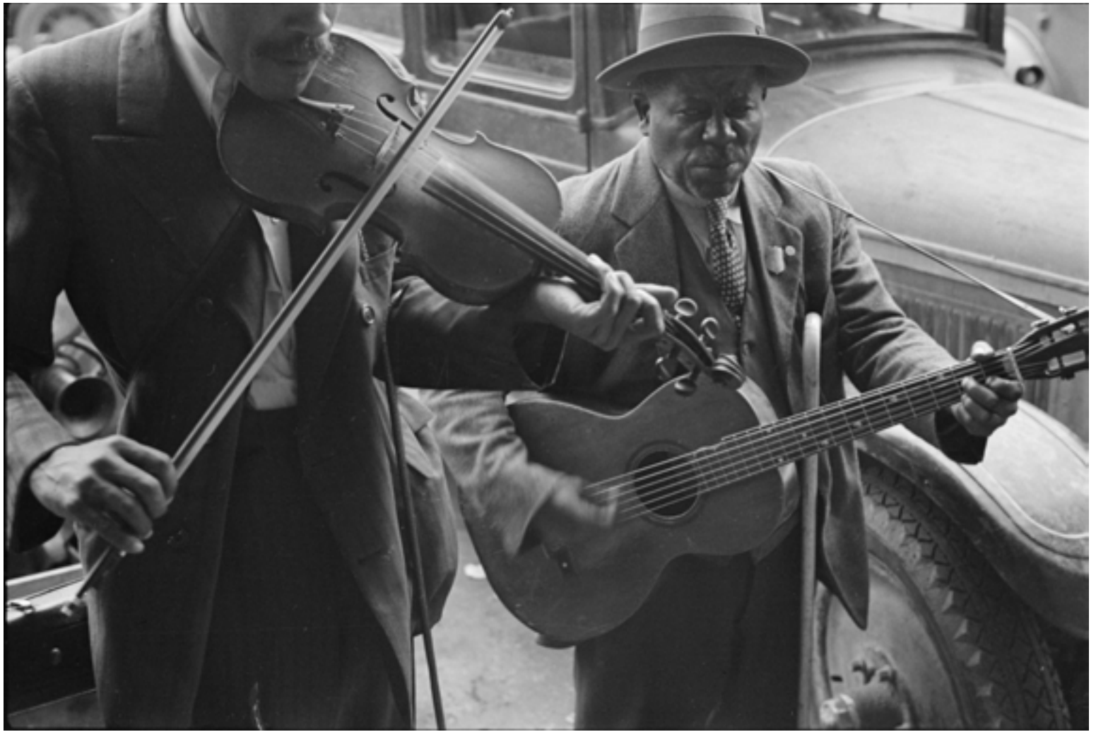
Blind street musician, West Memphis, Arkansas, Ben Shahn, 1898-1969, photographer. Date created, October 1935.