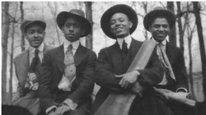
William Grant Still with school friends at Wilberforce University, Ohio, ca. 1915.

Arkansas is a place where influential musicians and song writers lived and worked. Composer, William Grant Still (second from right) grew up in Little Rock, Arkansas. He composed over 150 works including symphonies and popular songs. In 1936, Still conducted the Los Angeles Philharmonic performance of one of his works at the Hollywood Bowl.